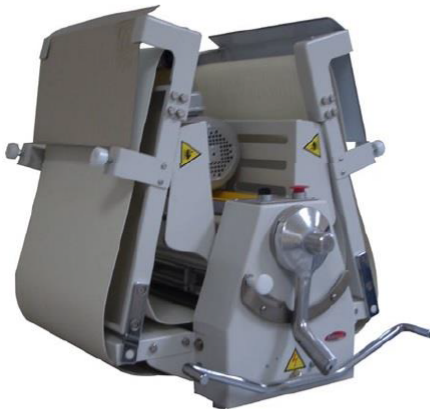
Easily folds to save space when not in use