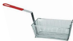
Fryer Baskets Included