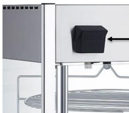
Easy Access Water Reservoir