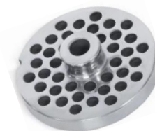
2 Plates Included (6mm & 8mm)

Due to continuous product improvement, specifications are subject to change without notice.