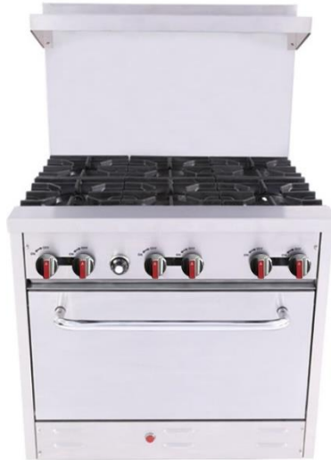
BAS360 36" – 6 Burner Range