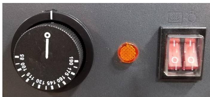
Manual Temperature Control