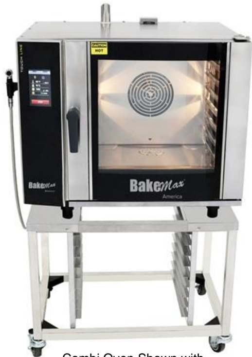
Combi Oven Shown with Optional Stand

The BakeMax America BATCO6 Series Combi Oven is designed to hold 6 full size Gastronome pans and is suitable for restaurants and kitchens of all sizes. Providing you with increased productivity and autonomy due to its easy control and great performance.