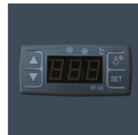
Digital Temperature Control & Display