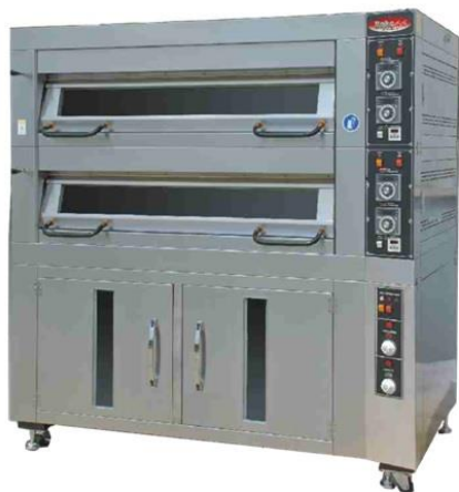
Deck Oven with Optional Proofer

Due to continuous product improvement, specifications are subject to change without notice.