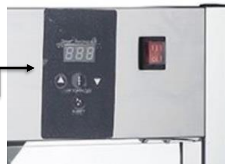
Digital Temperature & Humidity Controls

Due to continuous product improvement, specifications are subject to change without notice.