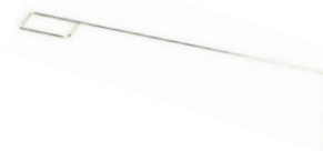
Drain Rod Included

Due to continuous product improvement, specifications are subject to change without notice.