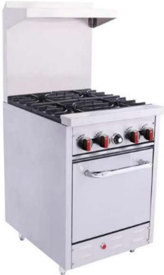
BAS240 24" – 4 Burner Range

The BakeMax BAS Range Series are constructed with 430 corrosion resistant stainless steel, including interior burner box which provides extra durability and easy to clean. All supporting brackets inside burner box are made of 304 stainless steel which is resistant to oxidation and corrosion. The cast iron star pattern top burners have no gaskets to leak. Each burner provides up to 30,000 BTU's. Their ovens are fully enameled with porcelain interior and the oven door lifts off easily for cleaning and maintenance. Each unit is NG and is supplied with LP conversion kit.