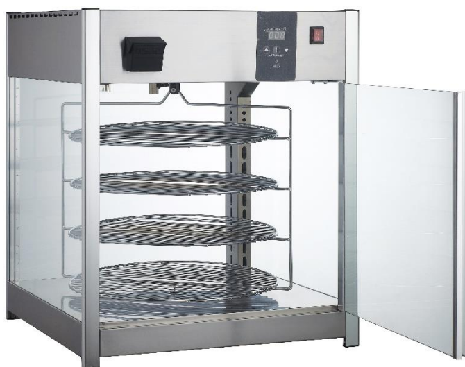
BMPW418 Pizza Warmer with Door Open