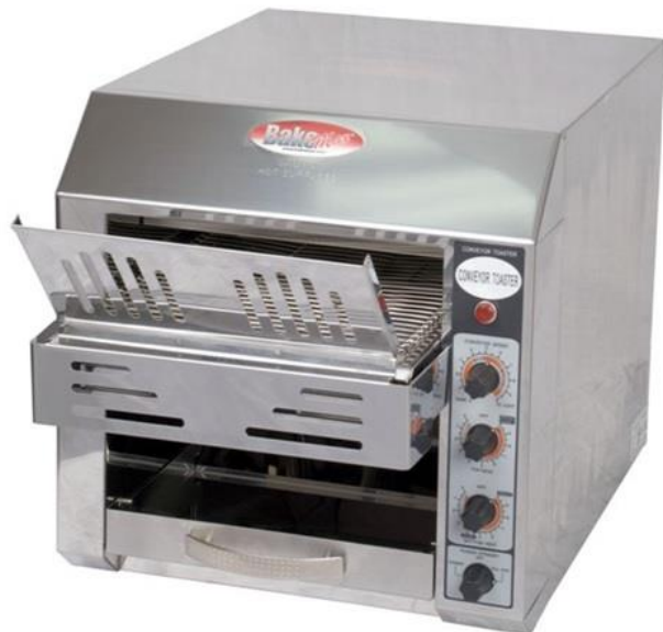
BMCT300 / BMCT305

The BakeMax BMCT Series Conveyor Toaster are perfect for toast, bagels and more. With its attractive design and easy to use functions this toaster is ideal for Restaurants, Hotels, Cafes, Delis and more.