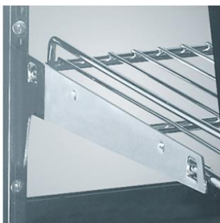
Chrome Plated Shelves

Water Pan located in front of BMTSC14 and in back for the BMTSC27 / 36 / 48