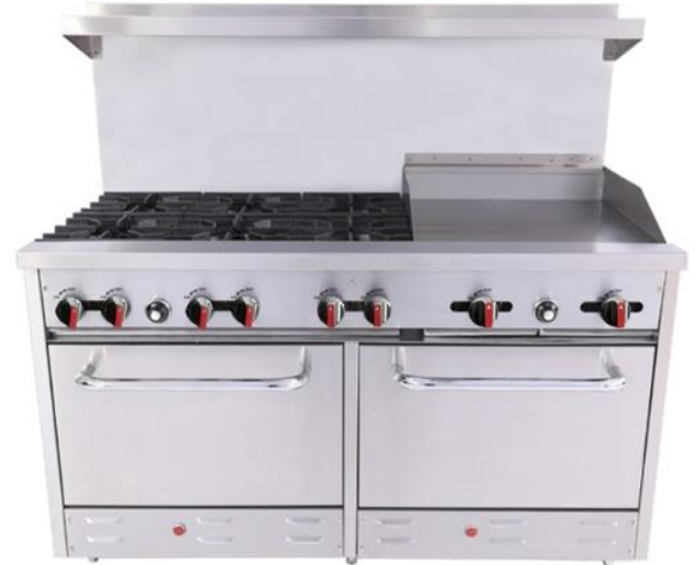
BAS36-24-2 60" – 6 Burner Range w/ 24" Manual Griddle